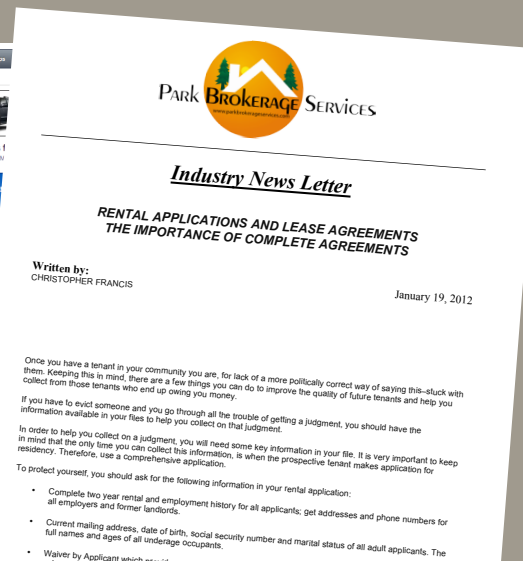
Marketing & Industry News